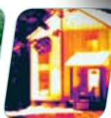
Home Inspection: Heat Loss