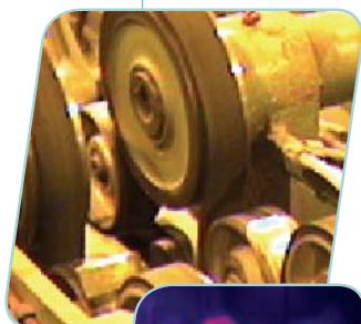
Pulley System: Hot Drive Belts

Put the legendary power of FLIR infrared technology in the palm of your hand -- for less than you think!